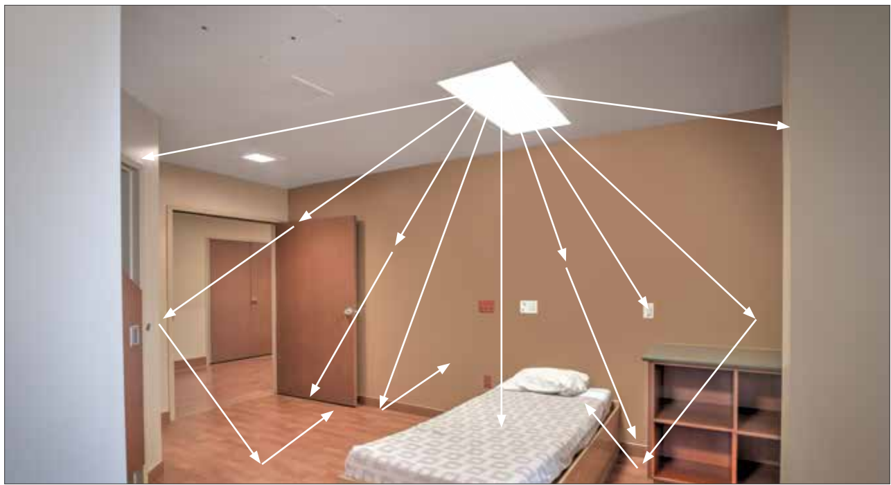
Indigo-Clean Technology uses visible light that reflects off of surfaces, disinfecting everywhere the light reaches.

Prevent the spread of Staph<sup>*</sup>, such as MRSA<sup>**</sup>, at a nominal cost to your facility. Kenall's Indigo-Clean Technology Retrofit Kit combines white ambient light with 405nm Indigo light, providing on-demand environmental disinfection